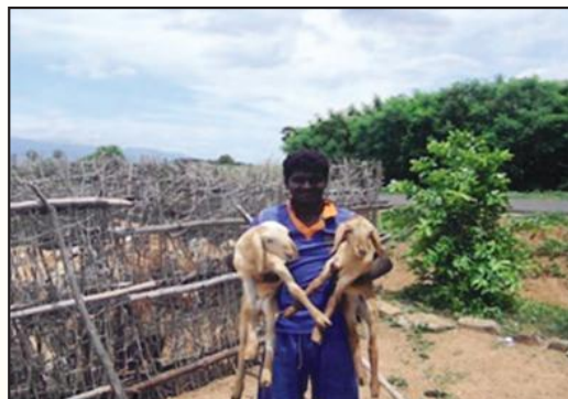
Fig.14: Breed introduction (NARI –SWARNA)