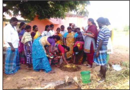
Distribution of soil health card