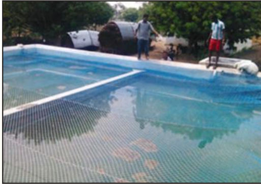
Fig. 18: Fisheries activities in NICRA village