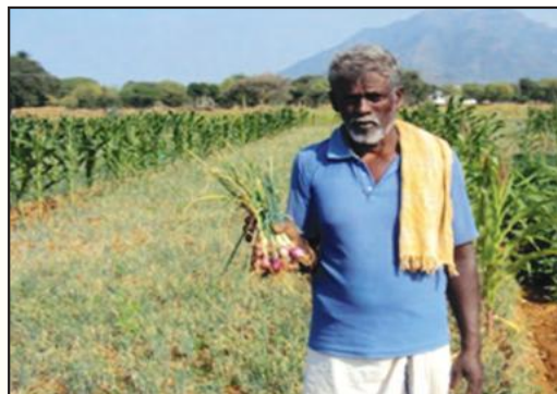
Fig. 10: Additional crop cultivation during excess rainfall