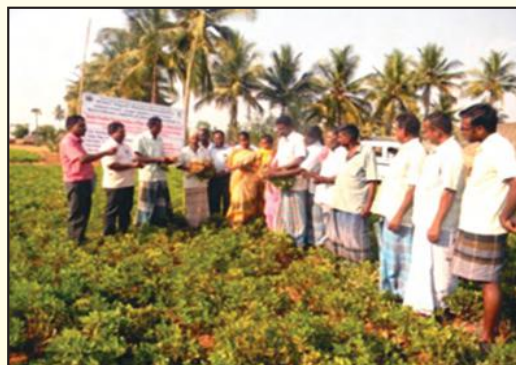
Fig. 22: Training programmes conducted at NICRA village