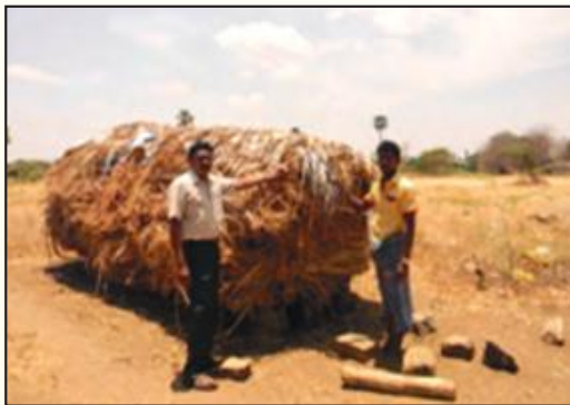
Before NICRA intervention