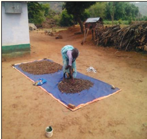
Fig. 8: Sun drying of seeds in NICRA village