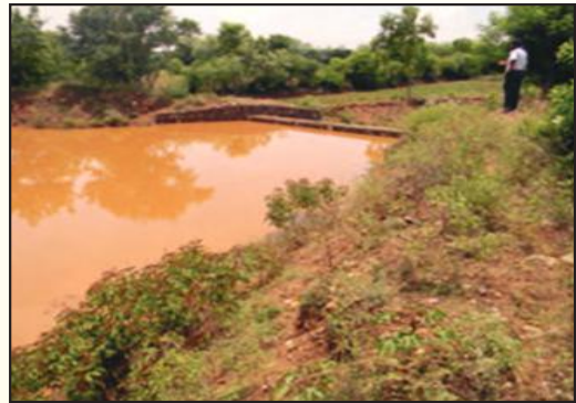
Fig. 4: Ponnakanni kuttai