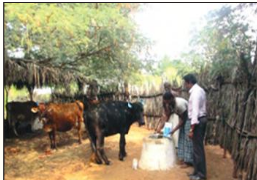
Fig. 17: Animal Health camp and deworming in NICRA village Mineral Mixture supplementation Foot and mouth disease (FMD) vaccination camp