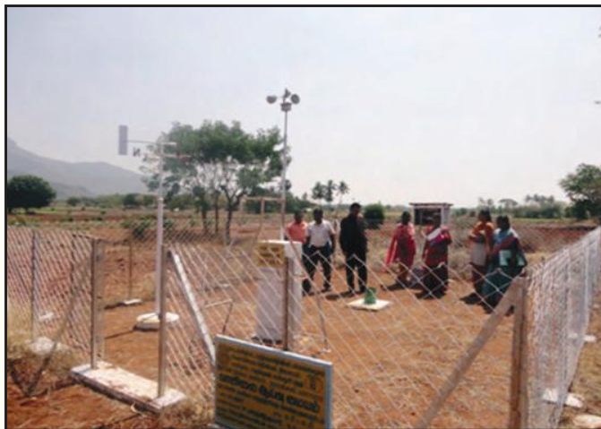
Fig. 6: NICRA weather station in Vadavathur village